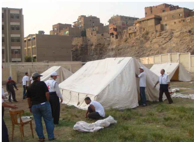
A temporary camp was erected in Manshiyet Nasr in order to host the affected families

Soon after the disaster, Egyptian RC established a relief emergency cell at its headquarters, headed by the director general and supported by the relief and logistic units. The National Society immediately mobilized its intervention teams and volunteers. They were deployed soon after the collapse on the site to assist the authorities during the rescue works.