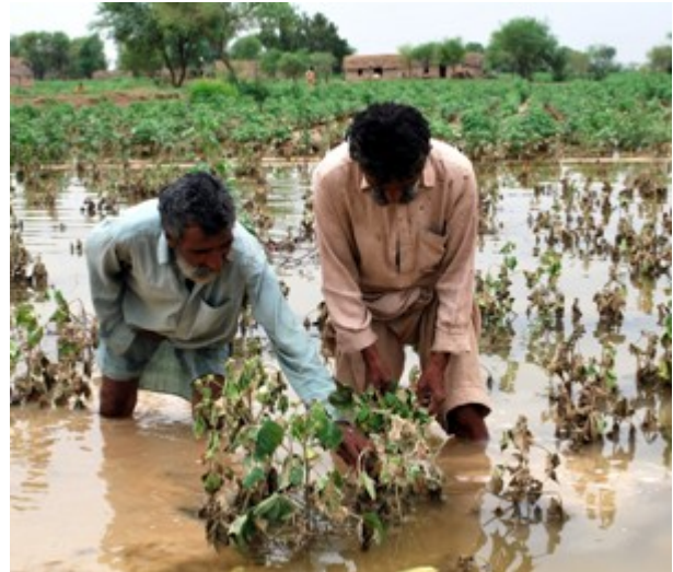
Farmers inspecting their flood hit cotton crop in Rajanpur district, southern Punjab

The PRCS/International Federation NDRT reached Rajanpur in Punjab on 5 th August to conduct an assessment there. The team consists of a team leader, a water and sanitation focal person, a health focal person, supported by the International Federation's disaster management manager and information officer. The team held meetings with the local government and visited some affected areas. It plans to carry out further assessments during the next few days. Further interventions will be based on the assessment team's report. The PRCS' provincial branch in Punjab sent an ambulance, with a doctor and a paramedic, to Rajanpur. Two PRCS water and sanitation personnel are being sent to PRCS' Bhawalpur district branch to prepare a water and sanitation plant (ERU), which was donated by the Swedish/Austrian Red Cross Societies during the Cyclone Yemyin/Floods operation in 2007.