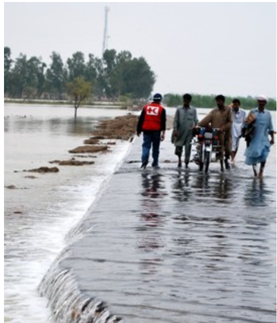
A flooded road in Rajanpur tehsil, southern Punjab

The Pakistan Red Crescent Society (PRCS), with the support of the International Federation, has determined that external assistance is not required, and is therefore not seeking funding or other assistance from donors at this time.