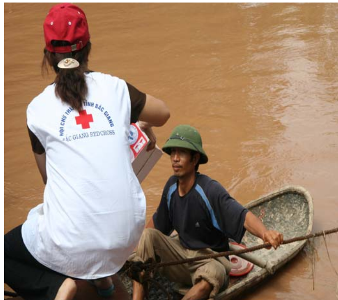
Small bamboo boats, like the one above, were used by the VNRC to access flooded areas and transport relief items

The Viet Nam Red Cross (VNRC) has released 1,000 household kits containing cooking utensils, a mosquito net, two blankets, ten-litre water bucket and a 40-litre plastic water tank to help collect water. The first relief items reached the people affected in the worst hit provinces of Bac Giang, Lang Son, Son La and Quang Ninh two days after the disaster. Approximately VND 400 million (CHF 26,614, USD 24,176 or EUR 16,778) in cash has been disbursed from the national society's disaster fund to support the four provinces in emergency relief. A total of 400 families in Bac Giang province will receive household kits, while in the other three provinces identified as the worst affected, 200 families will receive a household kit each. The provincial Red Cross chapters have also distributed up to 1,000 boxes of instant noodles; 7,200 bottles of drinking water; and 3,200 sets of clothes to affected families.