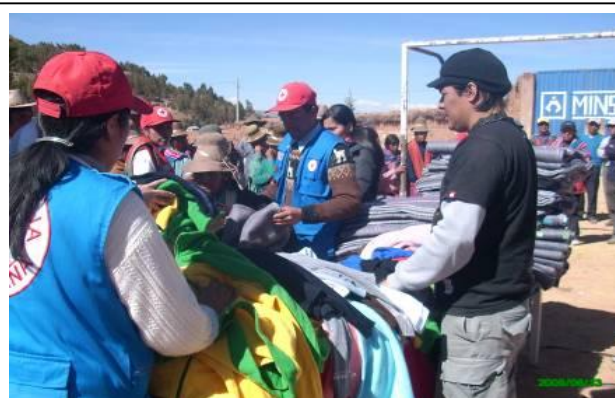
Peruvian Red Cross volunteers distributing donated clothes.

<View map or click here for detailed contact information>