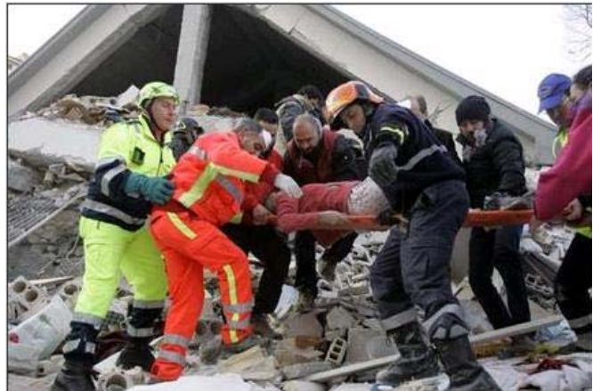
Rescue workers evacuating people from collapsed buildings.

Assessment of the most urgent needs is currently ongoing, and depending on its outcome a request for international assistance could be considered.