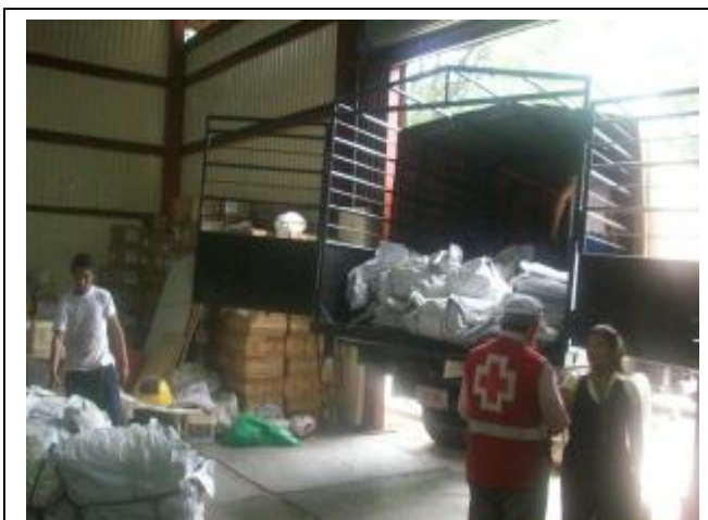
Nicaraguan Red Cross volunteers loading a truck with relief items to dispatch to the affected communities.

The Nicaraguan Red Cross has been in constant communication with the International Federation's Pan American Disaster Response Unit (PADRU) and agencies in-country providing initial information about the emergency. The NRC has been coordinating with local authorities, primarily with SINAPRED, the Civil Defense and the Municipal Committee for Natural Disaster Prevention and Mitigation (Comité Municipal para la Prevención, Mitigación y Atención de Desastres Naturales - COMUPRED).