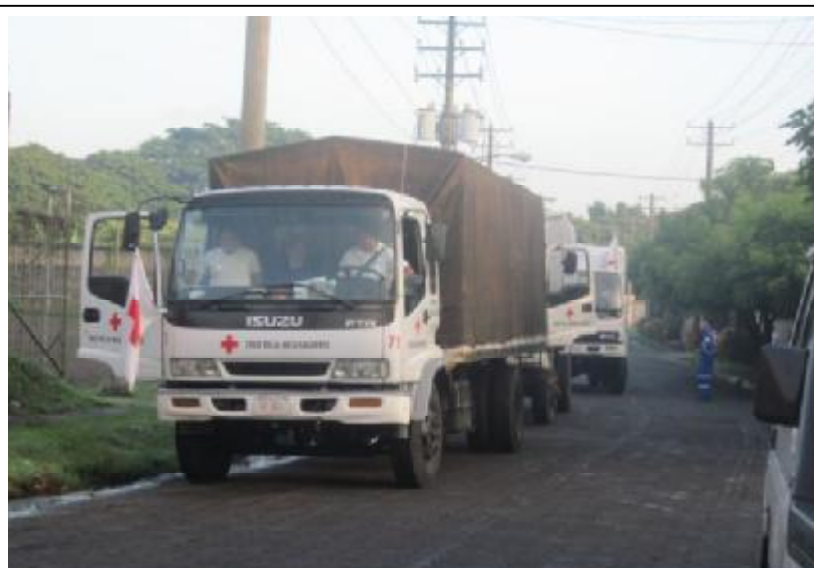
Nicaraguan Red Cross trucks ready to dispatch relief stock to the affected communities.

<Click here for the DREF budget, here for contact details, or here to view the map of the affected area>