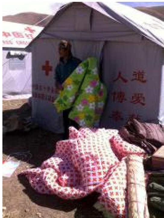
The Red Cross Society of China delivered tents, quilts, warm clothing and other relief supplies those affected in the earthquake area.

The Red Cross Society of China has responded with the delivery of tents, quilts, warm clothing and other relief supplies to the earthquake area. Medical teams have been deployed and have provided ambulance service, first aid, and surgical support to the injured. Water and sanitation emergency response teams have now arrived in Yushu and a public health team has arrived in Ganzi, Sichuan.