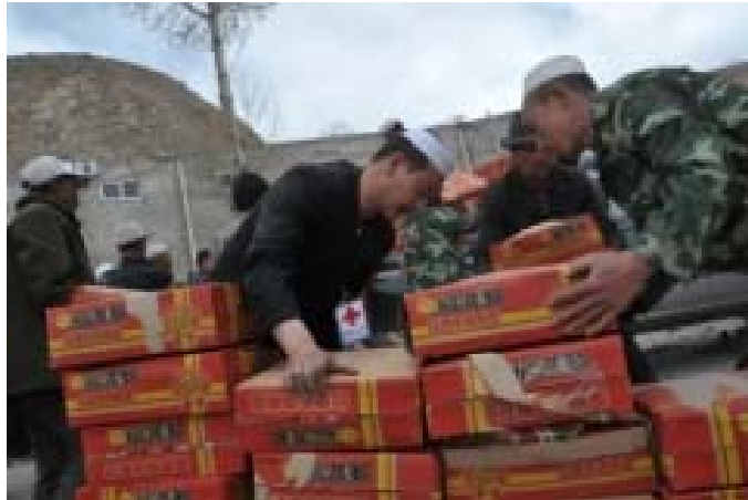
Qinghai Red Cross volunteers distributed relief items, such as these instant noodles, to the affected population in Yushu Prefecture.

As of today (23 April), the Qinghai Provincial Red Cross branch has organized nine volunteer teams to transport and distribute relief materials including quilts, tents, food, water and medicine to Yushu, valued at approximately CNY 10.8 million (CHF 1.7 million or USD 1.6 million). The RCSC and all branches of the Red Cross have received cash donations amounting to CNY 710.96 million (CHF 112 million or USD 104.3 million), and donations-in-kind valued at CNY 175.9 million (CHF 27.7 million or USD 25.8 million) for the earthquake relief operation.