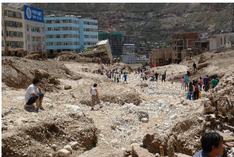
Zhouqu county in the aftermath of the landslides, where building and cars are covered in mud and buried under debris.

Rescue operations, however, could be further complicated as rains are forecasted for the next five days.