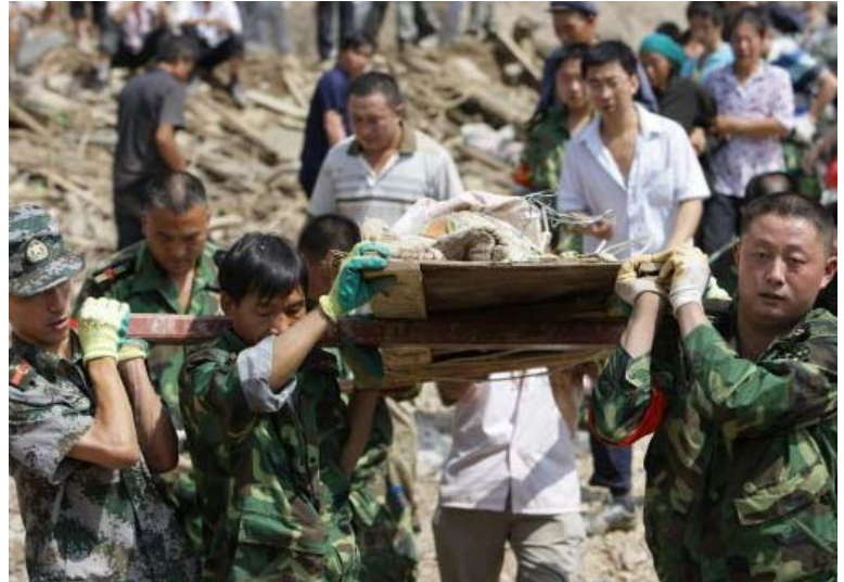
China's rescue teams struggle to rescue survivors in the latest round of landslides due to incessant heavy downpours in various parts of the country.

Most recently, heavy downpours that started on 7 August triggered landslides and mud-rock flows in Zhouqu county, Gannan Tibetan Autonomous Prefecture of Gansu province early on 8 August, leaving 337 people dead and approximately 1,300 others missing. According to local authorities, about 45,000 people were evacuated, and at least 307 homes were destroyed. Rescuers are still racing against time in search of survivors in the debris of the town flattened by the disaster.