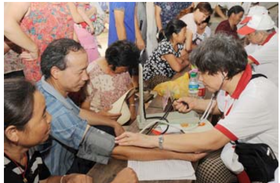
Free medical services were provided by a team of Red Cross volunteers to the worst-hit area in Fuzhou of Jiangxi province in Jiangxi.

The International Federation of Red Cross and Red Crescent Societies (IFRC) East Asia regional office is closely monitoring the situation together with RCSC and providing updated information as it becomes available. It has indicated readiness to support RCSC's relief operation as needed.