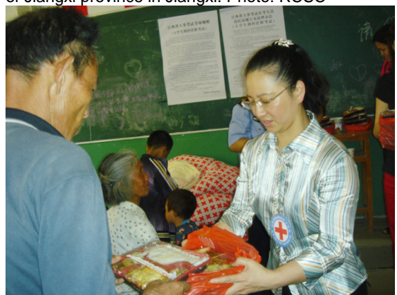
Apart from non-food relief items, local Red Cross branches also helped to provide food and safe drinking water for displaced population in temporary shelters and settlements.