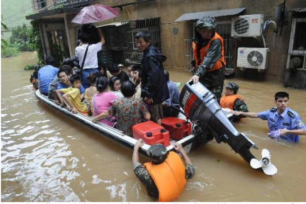
Local police and armed forces helped residents to transfer to safe place in Anqing, east China's Anhui Province on 13 July 2010.

river basin. So far the flood and resulting landslide caused at least 28 deaths and more than 60,000 affected. Along the Wenquan reservoir, more than 9,700 people had to be evacuated while hundreds of soldiers and armed police are still rushing to complete a drainage channel to prevent the reservoir from bursting which might lead to further floods in a city of up to 205,700 people.