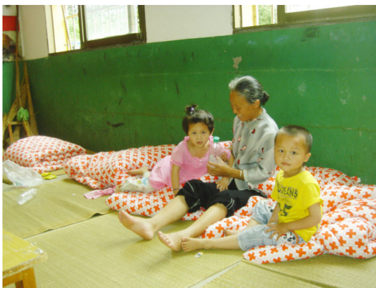
More Red Cross relief materials including Red Cross quilts are reaching the hands of affected people. Families are forced to evacuate for temporary shelters such as school classrooms in many of the affected area.

RCSC continues to support emergency relief operations in the affected areas. Additional relief materials were mobilized by both RCSC headquarters and its branches since the middle of July to four more provinces which are badly affected by the latest round of floods.