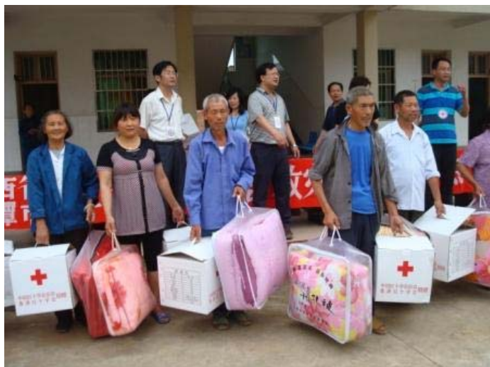
RCSC mobilized relief items and funds from headquarters and its branches to support communities affected by the floods, including in Guizhou province.

At this moment, RCSC has not sought an international appeal, but welcomes cash contributions from partners to support RCSC's effort on the floods' response and recovery. IFRC can also receive donations on behalf of the RCSC through its annual support plan in China. Please click here for IFRC's latest programme update available for details.