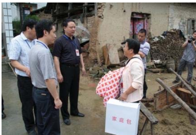
The Red Cross Society of China supports affected communities in Hubei province, one of the areas hardest hit, through relief distributions.

An RCSC assessment team composed of experienced disaster responders and two IFRC disaster management staff were deployed on 21 July to assess the needs of the affected populations in Hubei province.