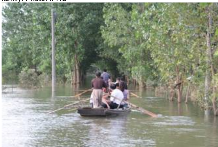
The assessment team travelled by boat across the flooded farmland to the temporary resettlement site to Zitan Village in Xianning.