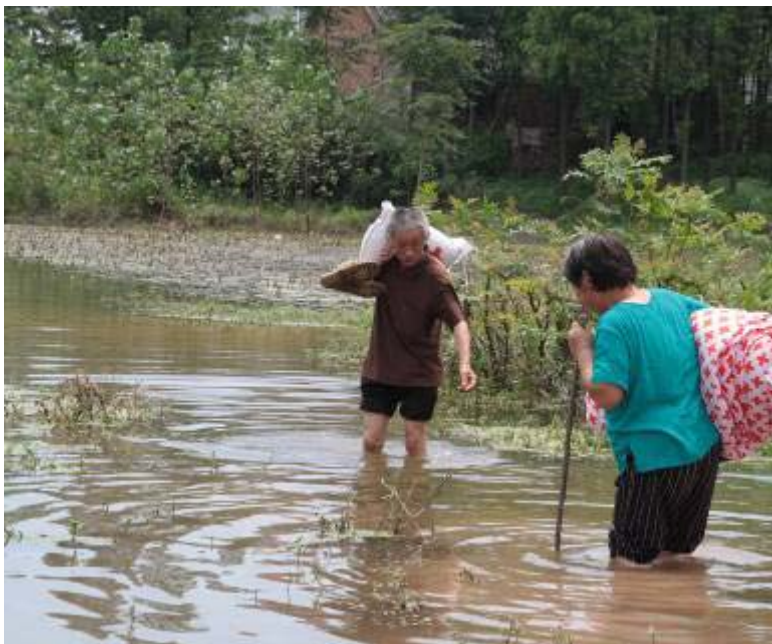
Villagers struggled back home through water, with rice and quilts distributed by the RCSC in Guowei village of Jingzhou Prefecture.

As of 21 July 2010, floods in the first half of 2010 and three major bouts of continuous torrential rains and storms between May and July have already claimed 742 lives, with 367 still missing, up to 7.6 million hectares of farmland affected and 670,000 houses destroyed. National media also indicate that direct economic losses have reached an estimated CNY 152.4 billion (CHF 23.4 billion). Levels of more than 230 rivers have passed the danger mark and in some areas along the Yangtze River, it is reported to experience the worst flooding in 30 years