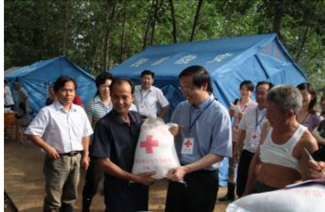
RCSC distributing food items, mostly rice to the displaced families. According to interviews by the assessment team, the need for food items is still a pressing concern among the affected communities whose farmlands has been completely destroyed by the water.

The IFRC East Asia regional office continues discussions with RCSC on how to support the emergency response to the floods through the IFRC's country plan for China for 2010.