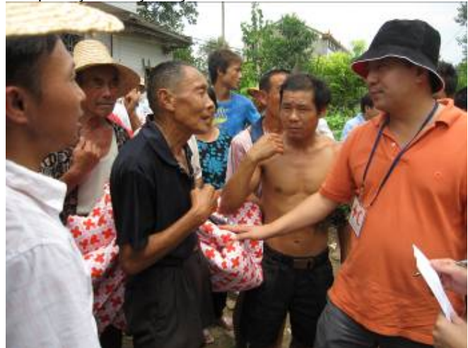
The RCSC assessment team met 72-year old beneficiary who now lives in a tent with five other members of his family, including his wife, his son, his son's wife and two grandchildren. His home was destroyed by the floods and food is scarce, with all their provisions finished. The entirety of his family's farmland was devastated and they are now very worried about having no income for this year. There is still no workable plan to recover the land on time to harvest a complementary yield before winter comes.