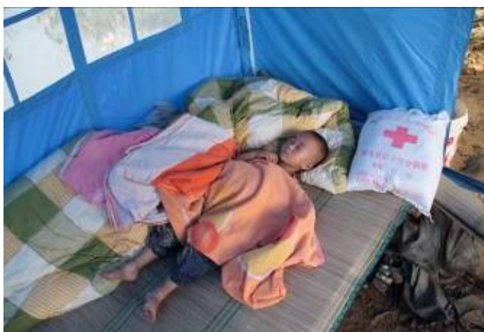
Villagers were forced to move from their homes as houses were destroyed or badly damaged by flooding or rains. Many seek shelter in tents, including the child pictured here sleeping when the Hubei Red Cross branch distributed a bag of rice to his family.

RCSC and local health authorities deployed health teams to provide basic medical care to the population. There is no major outbreak of diseases in the community visited by the assessment team. However,