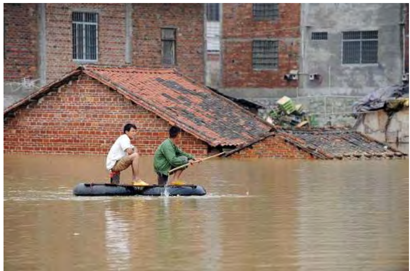
The floods and landslides have affected more than 29 million people in southern China. In response to the disaster, Red Cross Society of China mobilized and distributed relief items including quilts, tents and family packs to affected communities.

As of June 22, RCSC headquarters mobilized relief goods for the six provinces totalling CNY 4.38 million (approximately CHF 729,500 or EUR 523,000) in value, which include quilts, tents, family packs, warm clothes and drinking water disinfectant. Additional funds were also mobilized for relief goods procurement by local RCSC branches and to mitigate the impact of the disaster on survivors' lives and livelihoods.