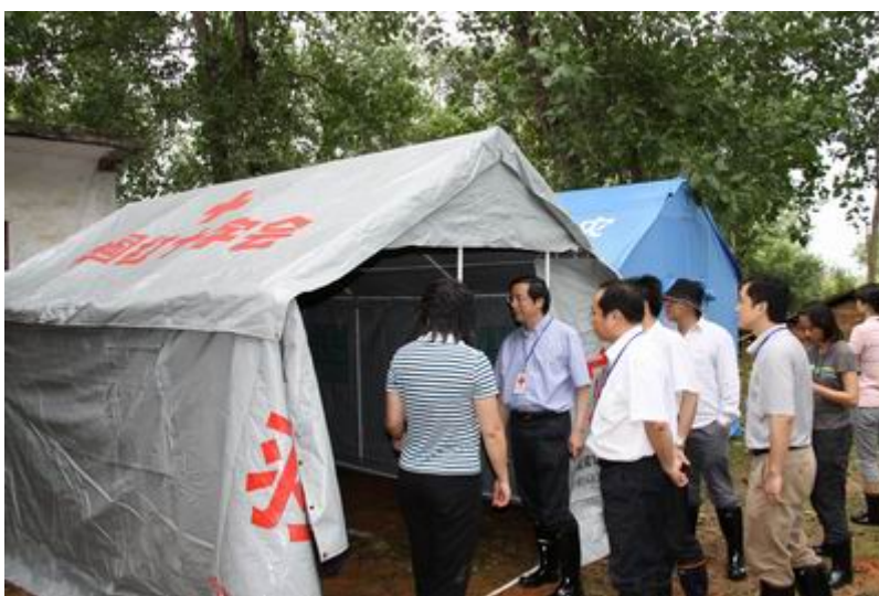
RCSC staff visited the people relocated in the tents allocated by RCSC in Hubei province.

As of 27 July, RCSC headquarters has provided assistance amounting to CNY 14.48 million (CHF 2.25 million) in cash and kind to the affected areas. Relief items distributed so far include tents, food (rice) and non-food items such family packets, quilts, blankets, towels and clothing. To meet urgent drinking water needs, the National Society distributed bottled drinking water and water