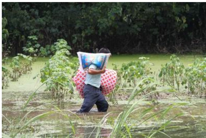
A beneficiary in Hubei province carrying the relief items distributed by RCSC back to home.

As of 27 July, the Red Cross Society of China (RCSC) headquarters has provided assistance amounting to CNY 14.48 million (CHF 2.25 million) in cash and kind to the affected areas, including a large shipment of relief items such as quilts, clothes and blankets to the most affected areas of Sichuan, Shaanxi, Henan and Liaoning provinces.