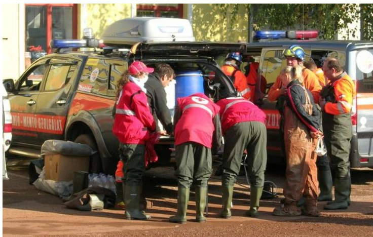
Hungarian Red Cross volunteers are participating in rescue activities in cooperation with authorities.

The surrounded settlements of the town of Ajka , Western Hungary, were hit by a red sludge spill caused by an industrial accident on Monday, October 4, 2010. The estimated total affected area rises to 800-1016 hectares, nine people were killed according to official reports.