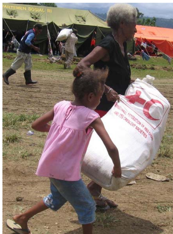
Indonesian Red Cross ( Palang Merah Indonesia /PMI) is distributing family kits to the displaced people of Wasior flash floods at the internally displaced people camp in the military district command field of Manokwari on Saturday, 9 October 2010.

Latest reports indicate that 145 people have died, 853 people are injured, and 4,625 people are displaced as a result of the West Papua flash floods that hit city of Wasior on 4 October 2010. Indonesian Red Cross ( Palang Merah Indonesia /PMI) continues to support the affected communities in first aid and relief distributions which include family kits and baby kits. The internally displaced people camp in Manokwari is a planned camp organized by the government where PMI is actively involved in delivering emergency health and public kitchen services for the affected people.