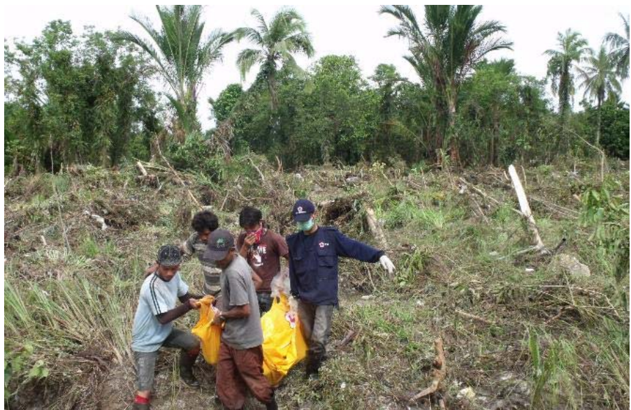
After sailing overnight from Sumatra Island, PMI volunteers and local search and rescue agencies arrived at Muntei, South Pagai on the Mentawai Islands on 27 October 2010. Affected areas are going through initial assessment and people affected by the earthquake and the tsunami on the Mentawai islands were being evacuated.

To date, rescuers from the government and PMI continue the search for bodies around the islands. Some areas are still unreachable. The affected areas are scattered as Mentawai is an archipelago of more than 7,000 small islands. At this point, the Government of Indonesia has announced a two-week emergency phase for the Mentawai operation.