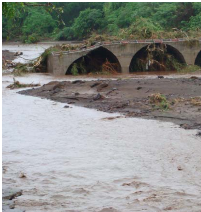
The Quezalguaque bridge has been affected by the floods.

<Click here for the DREF budget; here for a map of the affected areas; and here for contact details>