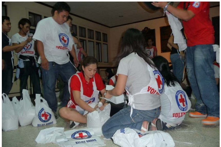
A Philippine Red Cross ambassador joins other volunteers in readying relief supplies. PRC has assisted 1,735 families to date.

Meanwhile, four joint Red Cross Red Crescent assessment teams are on the ground surveying the extent of the damage and the needs of affected communities. The teams comprise members from PRC, IFRC, German Red Cross and Spanish Red Cross. Rapid assessments have so far been undertaken in Cagayan, Kalinga, Isabela and Pangasinan and are presently ongoing in Cagayan, Isabela and La Union. The rapid response coordinator from European Commission's Humanitarian Aid department (ECHO) regional support office in Bangkok joined one assessment team in Isabela. Based on first observations, it is clear that there are significant, urgent shelter needs in Isabela where tens of thousands of houses have been either partially damaged or totally destroyed.