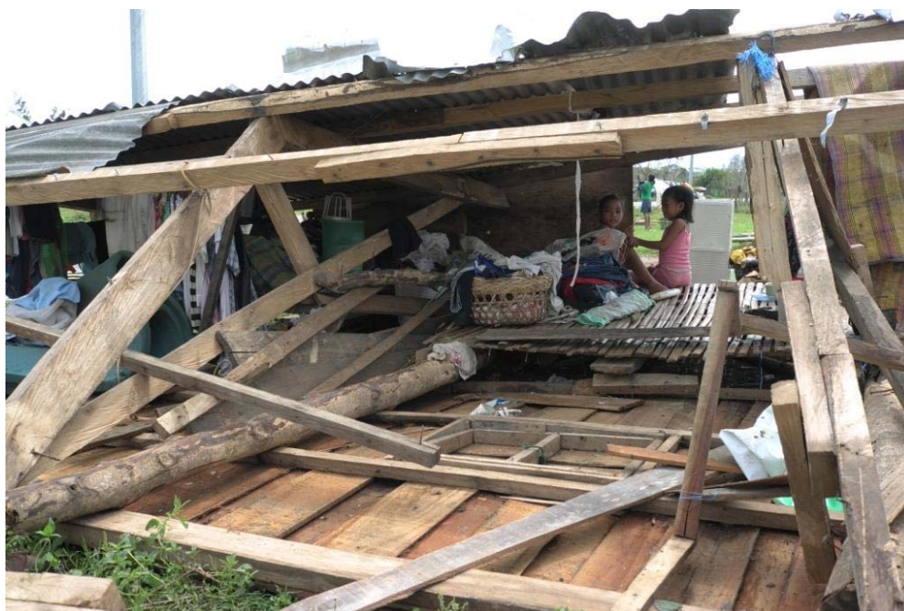
Observations by Red Cross Red Crescent assessment teams show a significant need for shelter assistance in Isabela which remains under a state of calamity. These children play at their destroyed house.

National disaster authorities have reported 19 typhoon-related deaths and 28 injuries, as of 21 October 2010 afternoon. Some 211,149 families (1 million persons) have been affected, with 5,428 families (23,127 persons) sheltered in 170 evacuation centres established across the affected provinces. At least 22,099 houses have been damaged; 7,947 of them destroyed and 14,152 partially damaged.