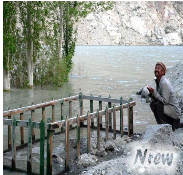
A local inhabitant of one of the villages that was directly hit by the catastrophe sitting near the sinking grave of his mother.

Massive landslides hit Hunza (Gilgit Baltistan) on 4 January 2010, sliding two villages into the Hunza river. This resulted in the blockage of the river and the Karakorum highway, thereby creating an artificial dam. According to initial reports, 2,500 people were affected and made to reside in four camps, set up by local authorities in schools/colleges of Altit village or with host families. The Pakistan Red Crescent Society Gilgit Baltistan district branch was among the first organizations to start relief operation in the affected areas. The water level in the dam has been rising at an alarming rate and has now reached 340 feet high.