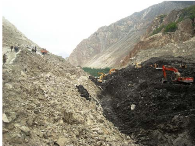
Federal Works Organization working to excavate the spill way.

Gilgit Biltistan disaster management authority (GB DMA) is effectively coordinating the operational response measures incorporating district governments of Hunza, Gilgit and Diamir, Frontier Works Organization, Force Command Northern Areas (the Army headquarters in the region), Agha Khan Development Network (AKDN), FOCUS (part of AKDN dealing with emergency response), PRCS and other humanitarian actors. PRCS was initially assigned a target of catering one village encompassing 195 households (1,538 people) by the district government. However, the actual figure has gone up 253 households representing around 2,000 beneficiaries.