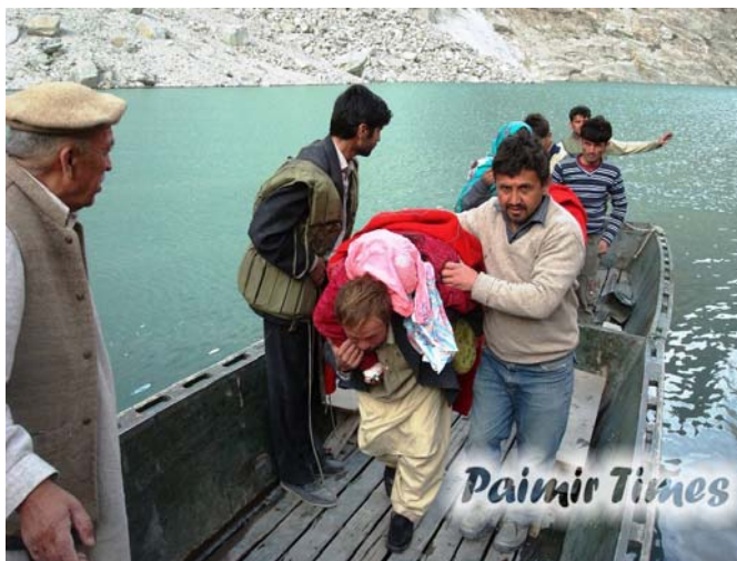
Evacuation from the areas where road access has been blocked is taking place through boats.

Massive landslides hit Hunza (Gilgit Baltistan) on 4 January 2010, sliding two villages into the Hunza river. This resulted in the blockage of the river and the Karakorum highway, thereby creating an artificial dam. According to latest news reports, 13,000 people have been evacuated from the down stream area. The displaced people are residing in 12 camps in Hunza, 11 camps in Gilgit or with host families. According to the latest updates, 2,170 people (310 families) have been registered in the camp established by Pakistan Red Crescent Society (PRCS) at Chilmisdass Gilgit. Due to landsliding, 22km of Karakorum highway has been blocked, impeding road access to up stream areas for the last four months. The relief goods are being transported to these areas through boats and helicopters, but now the water level has reached a critically high level, thus the government has planned to stop boat services. There is a critical need for food, non-food items and health services to the upper stream areas, whose estimated population is 25,000 people.