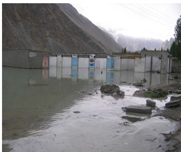
Collapsed houses in the affected areas where water level is continuously rising. The local inhabitants have been shifted to safe places.

In response to the evolving situation, the PRCS health teams are providing possible assistance to the in-camp IDPs. On the request of the local authorities, another health team shall move to Gilgit, to be dropped by helicopters to in accessible areas. PRCS, along with the government, is making its