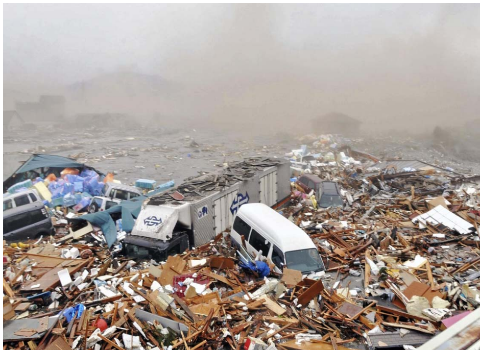
Houses and cars are swept out to sea in Kesenuma City.

<click here for detailed contact information>