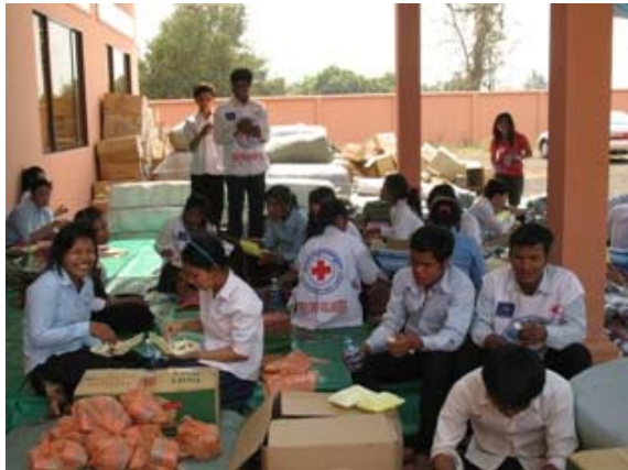
Local branches of Cambodian Red Cross assisted with preparing relief items.

<click for a map of the affected area, or for contact information>