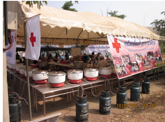
The Thai Red Cross mobile kitchen served over 7,000 meals each day, staffed by a combination of volunteer beneficiaries and Red Cross staff.