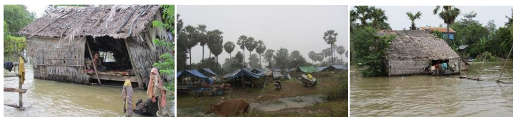
Kampong Thom province is presently the area most affected by these floods.

The flood waters still stand, while the rain continues to fall. According to government hydrology department forecasts that the water level and rain still stay until end of September 2011.