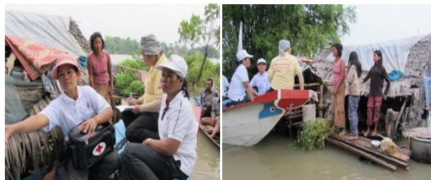
Kampong Thom Red Cross branch director and colleagues work very hard in order to conduct the damage assessment and relief distribution to the most affected people by flood in Prasath Sambo and Sandan districts.

From 13 August to 25 September 2011, Cambodian Red Cross, as the auxiliary to the Royal Government of Cambodia, and as a leading humanitarian organization in the country, has taken efforts in responding to the needs of the most vulnerable people affected by these severe weather events in ten provinces. The national society continues to extend its assistance to other provinces.