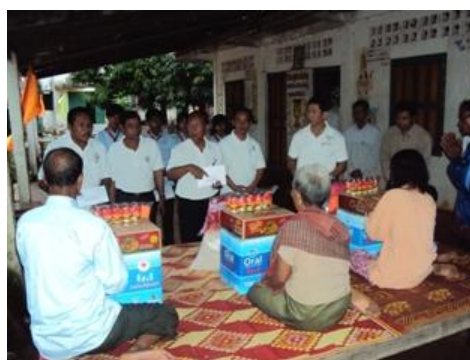
The CRC national headquarters team providing relief assistance to elderly community members affected by floods in Kampong Thom province.

With its own considerable funding and resources, Cambodian Red Cross mobilized assistance to the most vulnerable people who are worst-affected by these floods in ten provinces. The Cambodian Red Cross leadership, management, staff, youth, and volunteers from national headquarters level through to its network at the community level are working around the clock in order to ensure appropriate response and assistance are made available to those who most need it. Presently, the Kampong Thom province is the most affected area. All relevant authorities are working in very close coordination and cooperation to response to the situation.