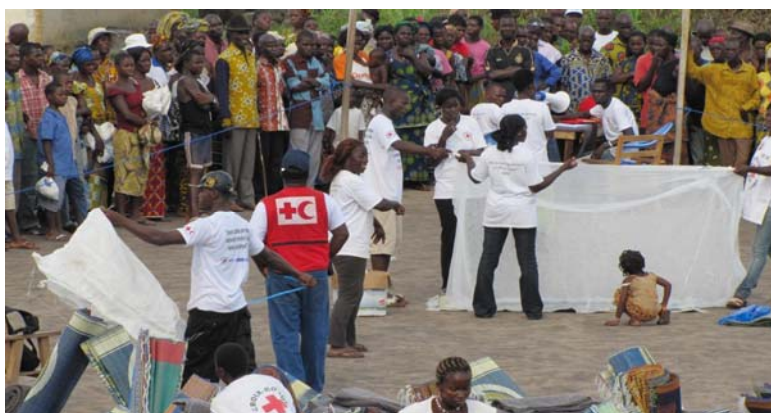
Distribution of essential non-food items (including sleeping mats and insecticide-treated bed nets) to displaced families.