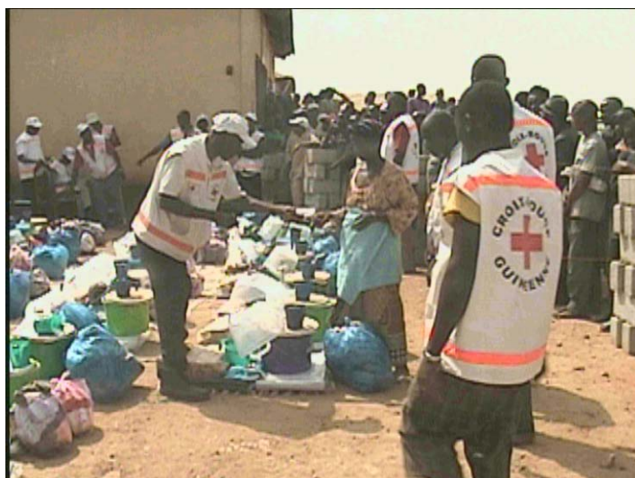
The Red Cross Society of Guinea volunteers distributing needed NFI in Siguiiri/Konomakoura.

The Republic of Guinea was struck by a series of floods following heavy rainfalls in August 2011 particularly affecting the Prefectures of Labé (city centre), Siguiiri, the sub-prefectures of Niandankoro, Kéniébakoura, the urban districts of Mandiana (Kiniéran), Gaoual, Matam (Heremakonon) and Matoto (Yimbaya market). An assessment revealed that a total of 1,920 houses were damaged or destroyed, and 542 latrines and 212 wells flooded and rendered unusable in places. This situation increased the vulnerability of the disaster-stricken communities