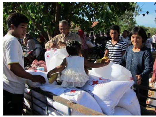
Relief distribution in Prey Veng was carried from October to November 2012.