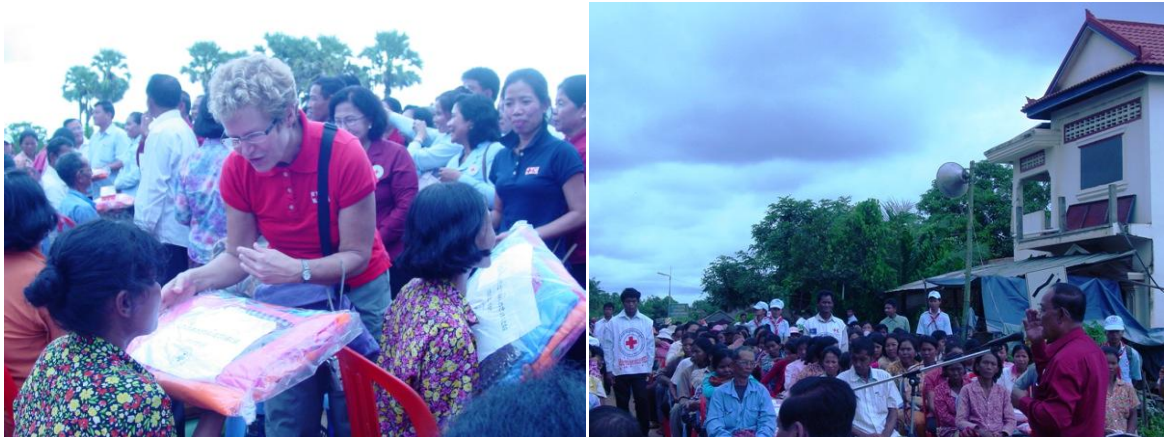
Relief distribution in Kampong Thom branch took place from mid-October to end-November 2012.

In Kampong Thom, distributions also were carried out from mid-October using the same funding approach, until 23 November in the three districts of Kampong Svay (for 1,108 families), Stung (505 families) and Santuk (887 families). The final distribution took place on 17 December 2011 in Kampong Savay's Phat Sanday village for 450 families.