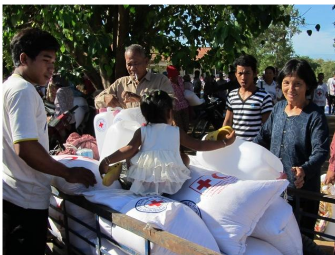
Flood relief distribution from various humanitarian aid agencies was provided to beneficiaries in Prey Veng province on November 2011 with key hygiene messages from Deputy Secretary General of Cambodian Red Cross.

Water filters for 8,218 families together with purification tablets and storage containers were distributed while activities on hygiene promotion in the use of safe water and how to avoid disease outbreaks before,