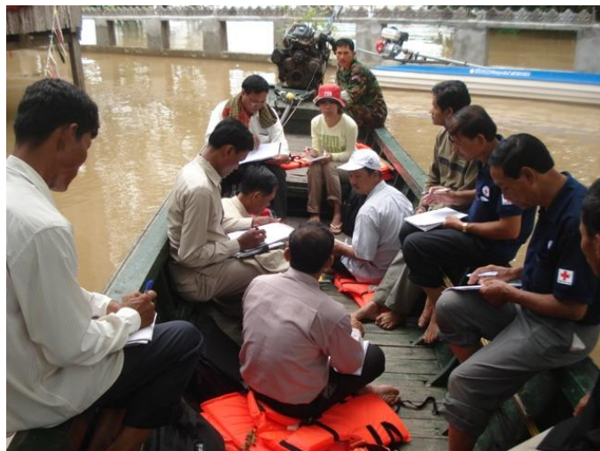
The rapid assessment team worked in the hardest-hit provinces of Kampong Thom and Prey Veng for three days, collecting data to assess the situation in order to develop the proposal for DREF funding.