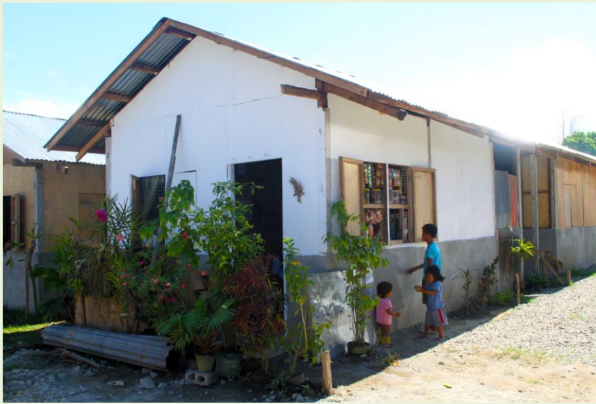
After receiving a cash grant from the Red Cross, one recipient invests in a sundry store in Barangay Hinaplanon, Iligan City. She earns at least PHP300 per day from her store.