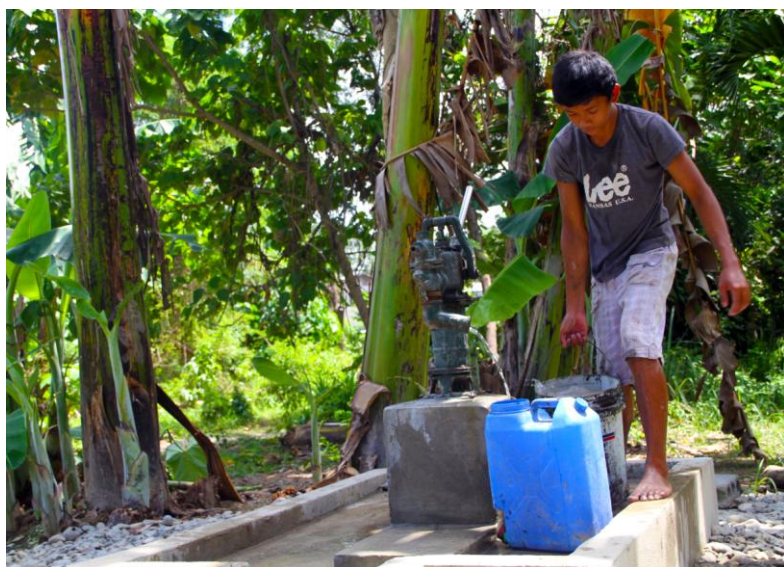
One year after Washi, residents now have improved access to water after the Red Cross installed 24 hand pumps in strategic points in different communities in Bukidnon and Iligan City.