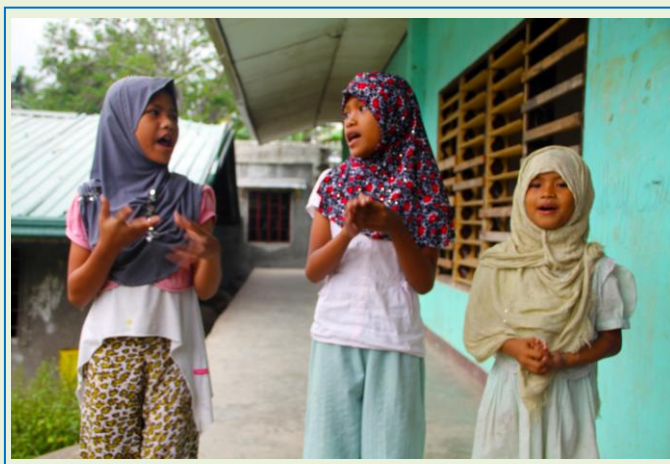
Students in schools reached with hygiene promotion sessions made a jingle when washing their hands. These pupils from Mahad Cabaro Al-Islamie in Barangay Upper Hinaplanon, Iligan City, demonstrate the proper washing of hands while singing the jingle.

"In water, in water, let us wash our hands With a soap, with a soap, wash it thoroughly Let's rub it, let's rub it, rub it thoroughly Rinse it well, rinse it well, and let it dry, and let it dry"