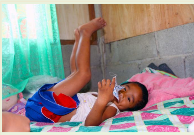
A five-year old plays inside his new home in Iligan City. According to his grandmother, their new house which now has an attached latrine with septic tank, has helped teach him practice healthier hygiene when going to the toilet.