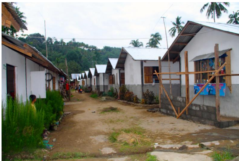
A year after Tropical Storm Washi, 900 families – including 50 families who moved to this village in Barangay Hinaplanon, Iligan City – have new homes.

Under this IFRC emergency appeal operation, the national society distributed 35,000 food packages to 20,000 families, non-food item kits – comprising blankets, sleeping mats and jerry cans – to 15,000 families, hygiene kits to 15,000 families, and mosquito nets to 5,000 families in Bukidnon, Cagayan de Oro and Iligan City.