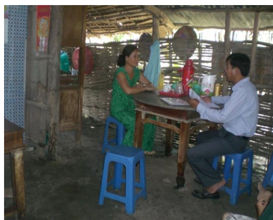
VNRC volunteer conducting a household interview as part of recovery assessment in Long An.

Other areas that have improved throughout the operation have been with regards to VNRC taking a lead role in promoting support by IFRC and partner national societies under the 'one operation approach' . This has resulted in greater streamlining of planning, allocation of resources and communication by all involved to ensure that the needs of those most affected have been addressed accordingly.