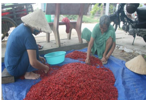
Common source of livelihoods in Long An is planting and sorting chilli.

In response to the Mekong floods operation, livelihoods was identified as an area of intervention under the emergency appeal to support those affected by the floods. Following the implementation of the relief phase, VNRC, with IFRC support, commenced with mapping and planning the operational process for the recovery phase. During the planning it was agreed that further information was required among the three provinces in order to ensure that the identified needs under the emergency appeal for livelihoods was valid, and if so was the original livelihoods intervention identified during the relief phase still relevant moving into the recovery phase.