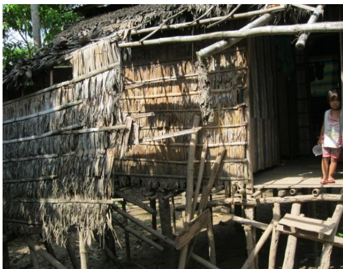
Family affected by Mekong floods in temporary shelter in An Giang.