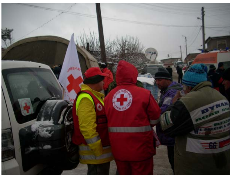
Bulgarian Red Cross conducting needs assessment in the area affected by floods.

This bulletin is being issued for information only, and reflects the current situation and details available at this time. The Bulgarian Red Cross, with the support of the International Federation of Red Cross and Red Crescent Societies (IFRC), has determined that external assistance is not required, and is therefore not seeking funding or other assistance from donors at this time.