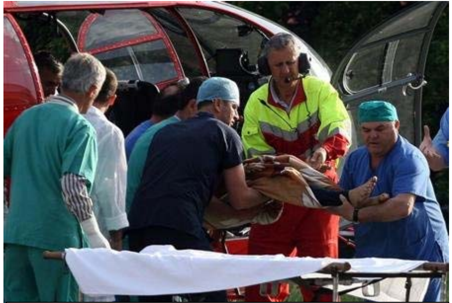
Rescue teams and ambulance are taking one of the injured students to the hospital.

One bus carrying 33 people has fallen 80 meters off the road in the mountain slope, killing 11 people and seriously injuring another 22. Based on official information, two persons died on the way to hospital, raising the total death toll to 13 people. The bus driver was among the dead.