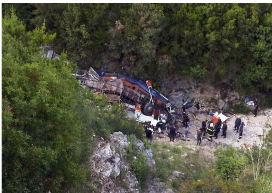
A bus plunges 80 meters (260 ft) off a cliff. Most of the victims were university students of Aleksandër Xhuvani University of Elbasan

The Albanian Red Cross, with the support of the International Federation of Red Cross and Red Crescent Societies (IFRC), has determined that external assistance is not required, and is therefore not seeking funding or other assistance from donors at this time.