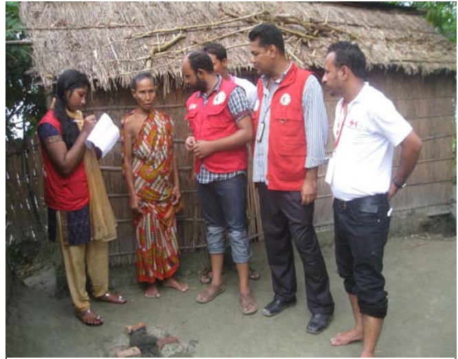
Beneficiary selection survey by Red Cross youth volunteers and assisted by NDRT member.