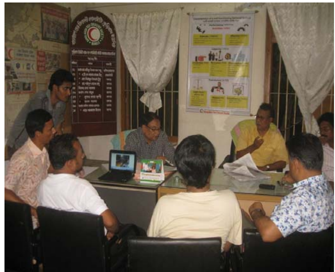
BDRCS district unit Executive Committee members are in a meeting for emergency response planning.

In relation to Restoring Family Links (RFL), the assessment did not identify any need for action at this stage. BDRCS tracing department, with support from ICRC, will continue to monitor the situation with concerned units.