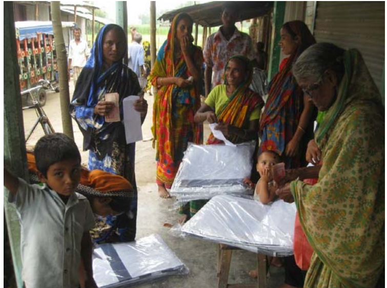
Beneficiaries counting cash after the distribution in Gaibandha districts.

Operation update 1 covering period 4 July to 10 September 2012 which was published on 20 September 2012 can be accessed here .