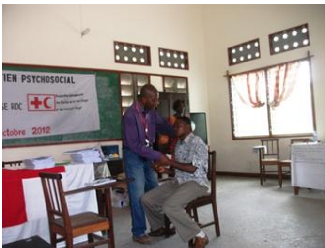
DRC Red Cross volunteers were trained on how to provide psychosocial support to Ebola affected people

Over 150 community volunteers of the Democratic Republic of Congo Red Cross (DRC RC), 25 supervisors placed under the control of the provincial committee and headquarters were mobilized to respond to the Ebola hemorrhagic fever outbreak reported in the Equateur Province, in August 2012. While in the field, they were all supported by a field delegate and the Regional Health Coordinator of the Federation.