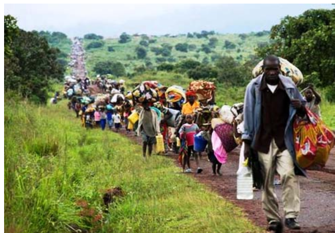
Since June 2012, more than 1,700 people from the Central African Republic have been crossing the Ubangi River to seek refuge in neighbouring DRC (Equateur Province).

The villages of Pandu and Guele in the Democratic Republic of Congo (DRC) are experiencing a population influx from the villages of Gbasiki and Gbazamba in the Central African Republic (CAR). These populations, estimated at 1,727 people, are fleeing violence being committed by armed elements who invaded their home villages since June 2012, forcing them to cross the Ubangi River and seek refuge in the DRC. While refugees started arriving in June, the numbers have been steadily increasing and became concerning in August, when the number reached an unprecedented 1,727 people.