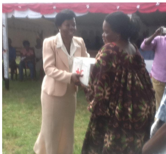
CAR Minister of Social Affairs symbolically handing over NFIs to a beneficiary.

Continuous rain, accompanied by strong winds at the end of August, caused localized floods that led to the collapse and damage of houses and loss of property and livelihoods. Affected localities included Paoua, Bangui-Bouchia (Mbaïki) and some districts of Bangui and Begoua. In response, the National Society deployed 120 Red Cross volunteers of affected localities to conduct a rapid assessment of the situation. They identified 2,740 vulnerable families (13,700 persons) whose houses were completely or partially destroyed with urgent needs including non-food items (NFIs), basic necessities, emergency shelter and drinking water. CAR Red Cross volunteers also noted the need to ensure the promotion of hygiene and sanitation in affected communities.