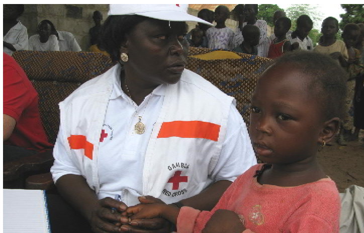
A GRCS Health Coordinator screening a child for malnutrition in Kiangkarankaba.

This Revised Appeal now seeks CHF 1,100,051 in cash, kind, or services to support the GRCS to assist 5,778 households (34,668 beneficiaries). The initial 8 month timeframe remains the same, and the operation will be completed by the end of December 2012. A final report will be made available by the end of March 2013 (three months after completion).