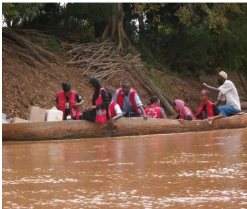
KRCS medical team in Tana Delta crossing the Tana River to conduct a medical outreach in Kau village.

The Society integrated psychosocial support into its health services in order to support the healing of community members from trauma. High levels of trauma were noted amongst the beneficiaries immediately following the attacks and counter attacks. The psychosocial team employs various methods of counselling including group therapy, individual therapy as well as child therapy sessions. A total of 2,376 beneficiaries have so far been provided with this support. Cases that are complex are also referred for specialized care.