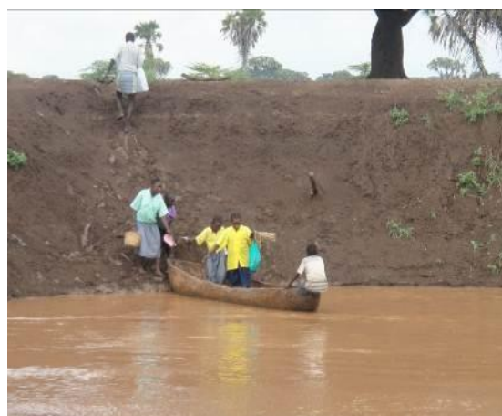
School going children going and coming from school in Tana Delta district.