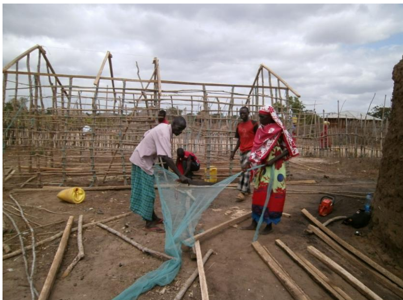
Household reconstruction by project beneficiaries in Kipau village, Tana Delta district.