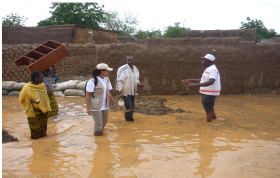
The Red Cross operational team in the outskirts of Niamey among flood affected families.

Summary: CHF 284,456 was allocated from the IFRC's Disaster Relief Emergency Fund (DREF) to support the Red Cross Society of Niger (RCSN) in delivering immediate assistance to 1,500 households affected by floods. The DREF operation was launched on 6 September 2012 following heavy rains that caused severe flooding in the regions of Dosso, Niamey, Agadez, Zinder, Maradi, Tahoua, Tillabéry and Diffa, affecting over 530,000 persons. The RCSN initiated their response with performing rapid needs