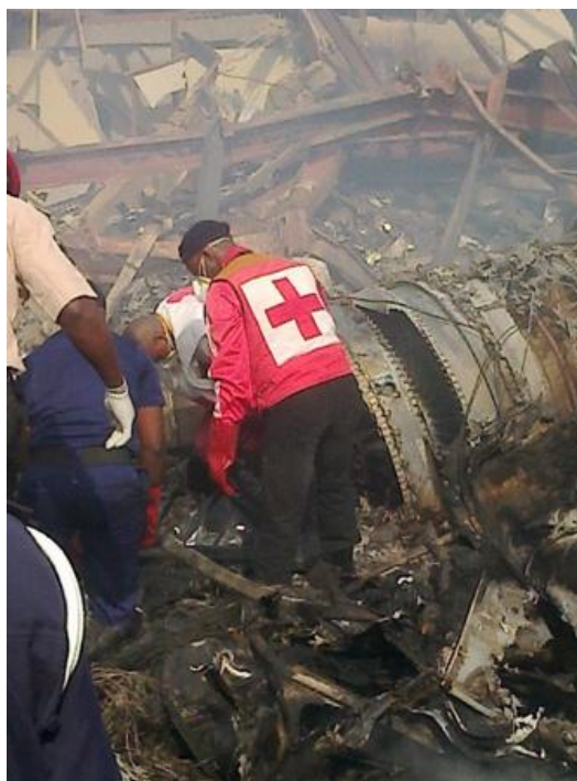
Volunteers of the Nigerian Red Cross Society, Lagos Branch with other responders during the emergency operation at the Dana Air crash site on 3rd June, 2012 in Lagos.

The PSS programme also provided a platform for the operational and technical collaboration between the NRCS and the Psychology Department of the University of Lagos, which enabled a longer duration for the intervention for psychological healing for the 150 families beyond the time frame of the DREF (four months