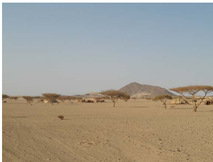
Drought in the Red Sea state of Sudan.

CHF 250,000 was allocated from the International Federation of Red Cross and Red Crescent Societies' (IFRC) Disaster Relief Emergency Fund (DREF) to support this operation. Un-earmarked funds to replenish DREF are encouraged.