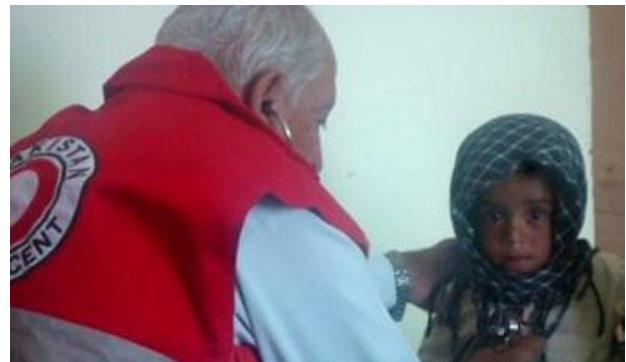
PRCS medical team attending to a girl at District Headquarters Hospital Awaran, in the earthquake affected areas of Balochistan province.

On 26th of September 2013 PRCS deployed a health team - comprising of two doctors and four paramedics - via helicopter from PHQ Sindh for provision of emergency health services in the affected district of Awaran. The team started providing health services from 27 September for a one-week period, and were joined by the two teams (each comprised of one doctor and two paramedics) from the provincial branch of Balochistan and remained operational until 7 November. One team supported the District Headquarter (DHQ) hospital in Awaran and the other provided mobile health unit (MHU) services to approximately 20 villages. Most of the cases presented were of injuries, wounds, acute respiratory infections, acute diarrhoea, skin and eye infections as well as psychological conditions. The health teams also