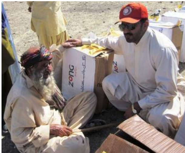
An earthquake affected beneficiary of PRCS assistance in Bazdad village of Awaran District, Balochistan province.

The Government of Pakistan has not requested for international assistance.