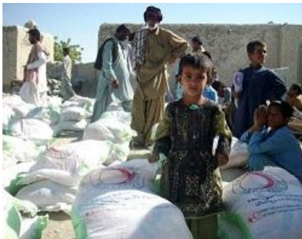
Earthquake affected families of Balochistan receiving much needed emergency food assistance in Teertej village of Awaran District.

PRCS was on the ground for initial assessments within 36 hours after the quake, and operational by 27 September providing emergency health services following with basic relief to the affected 72,890 people