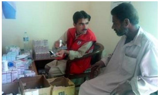
A PRCS medical team member, deployed to support the District Headquarters Hospital Awaran, providing emergency medical consultation to a person affected by the recent earthquake in Balochistan province.

Security concerns and the lack of availability of, female medical health care providers was a significant challenge in the affected areas to reach women with a more comprehensive female-oriented package of health services. However, committed PRCS medical teams from Sindh and Balochistan provinces made deliberate efforts to reach as far as possible.