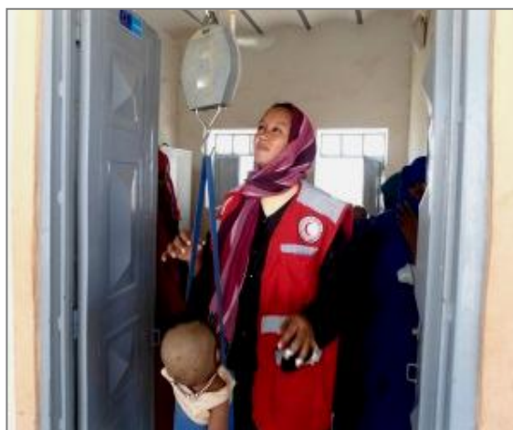
SRCS volunteers participating in the nutrition centres activities in Kasalla state, 2013.

Summary: This report reflects the activities accomplished during the implementation period of 12 months in Kasalla and Red Sea states. Through this appeal SRCS aimed to support 64,000 beneficiaries in Red Sea State with relief operation, as well as enhance the operational capacity of SRCS to respond to potential future disasters throughout Sudan.