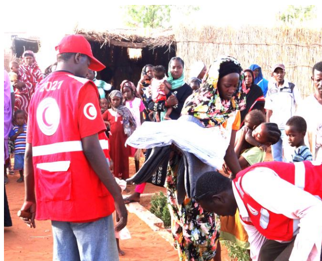
SRCS volunteers during the distribution process for the conflict affected people in North Kordofan state.

<click here for final financial report; here for contact details>