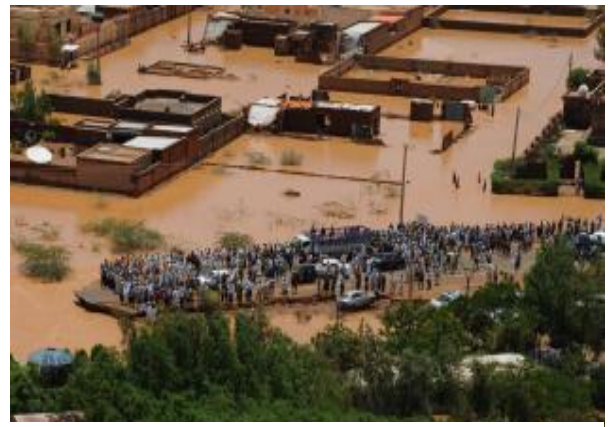
Flash Floods in Shareg Anniel locality in Khartoum, Sudan in August 2013.

Enhanced rains in Sudan have led to flash floods, which have caused the destruction of homes, infrastructure, livelihoods and displaced a large part of the affected population and caused the death of 11 persons. Based on SRCS assessments, the flooding has so far affected an estimated 15,462 households (up to 98,726 persons). Approximately 9,646 houses have been completely destroyed and 5,816 more houses have been partially damaged. The United Nations Office for the Coordination of Humanitarian (OCHA) reports estimate that approximately 121,000 persons are affected by the floods and there are still unconfirmed reports that more communities and households are affected.