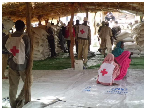
The Red Cross of Chad is in charge of several sectors in the field including food distribution.

The funds released from the DREF allocation enabled the provision of tarpaulins, buckets, sleeping mats, and soaps for 1,280 families and construction of 300 emergency latrines. To support the operation, 31 volunteers were trained to provide support and three Regional Disaster Response Team members were deployed.