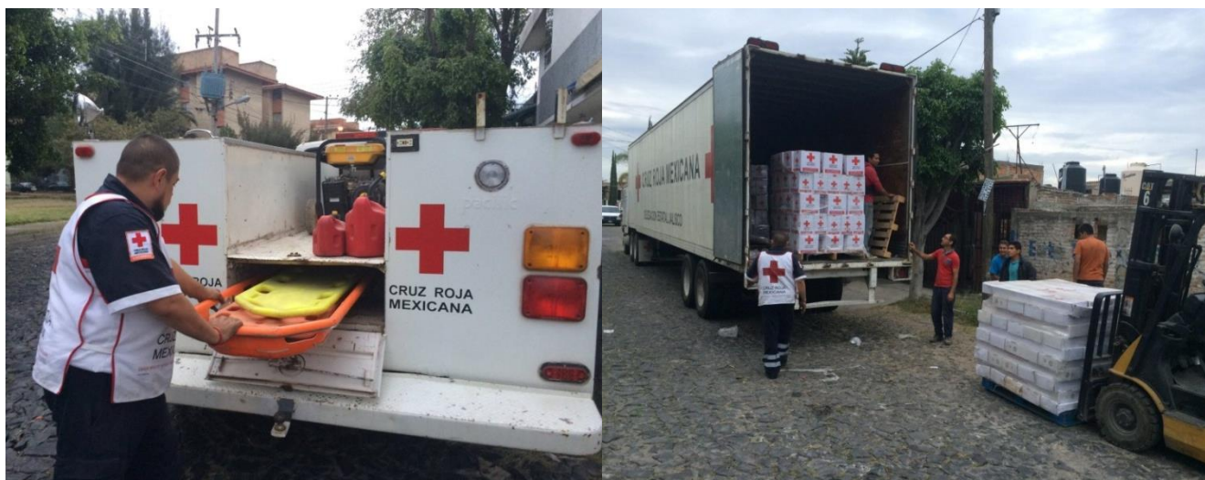
The Mexican Red Cross branch in Jalisco dispatching relief items to Puerto Vallarta to prepare for Hurricane Patricia's impact.

The Civil Protection national coordinator notified the public through the media that approximately 50,000 people have been evacuated along the coasts of Jalisco, Nayarit and Colima. The Navy Secretary is supporting these activities. Additionally, 782 evacuation centres have the capacity to shelter 258,000 people. The Navy Secretary activated the preventive phase of the Navy Plan, deploying 4,000 marines along the states of Jalisco, Colima, Nayarit, Michoacan, Guerrero and Oaxaca along with vehicles, ships and aircrafts.