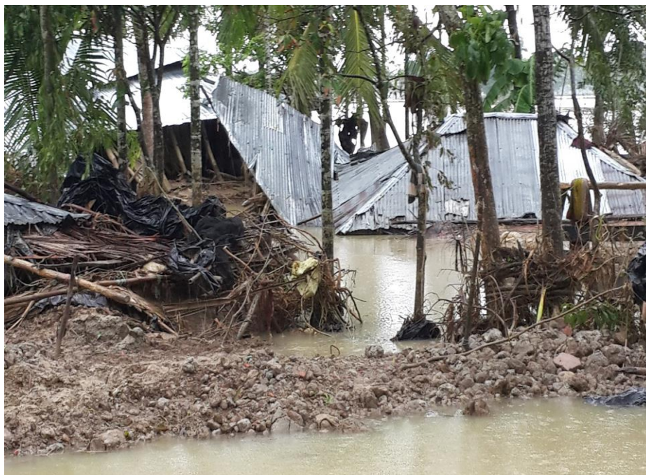
Damaged houses at Ramu Upazila, Cox's Bazaar.

Excessive rains from 26-30 June caused flash floods and landslides on 30 June in the south-eastern region of Bangladesh. According to the Disaster Management Information Center of the Ministry of Disaster Management and Relief, the three districts, namely Cox's Bazar, Chittagong, and Bandarban, are affected. In total, 131 unions experienced floods, directly affecting 276,250 families, with 25 per cent of the houses fully damaged. A total of 371.5 kilometres of road were inundated and damaged due to flooding, while 5,310 acre of crops has been fully destroyed.