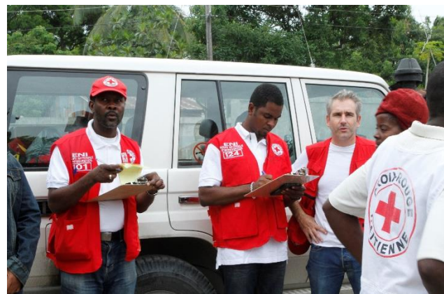
National Intervention Team conducting preparedness actions in Haiti.