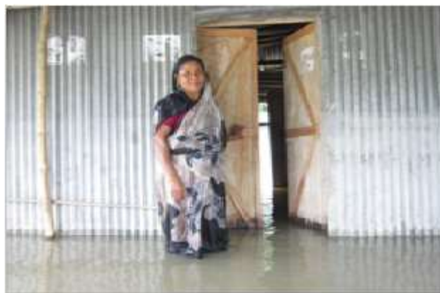
One of the many flood affected families is leaving their house due to the current flood situation in Bogra district.

Due to monsoon downpour since 19 July 2016 and downstream flow from upstream has slowly increased the water level. Several areas in Bangladesh are experiencing floods since 22 July 2016. The flooding situation in the north and northeastern regions is deteriorating as the water level in the Jamuna, Teesta, Dharla, Ghagot and several other rivers reached above the danger level, forcing thousands of people to move from their houses. The flood affected families in these areas are in need of foods, safe drinking water, medicine, oral saline, emergency shelter and latrines. Many people have been living under the open sky with limited food. At least six persons including two children were drowned in the floodwater in Gaibandha and Nilphamari. The overall flooding situation worsens across the country due to the incessant heavy rain and tidal surge in the last couple of days. According to the Flood Forecasting and Warning Centre (FFWC), some parts of low lands adjacent to Brahmaputra and Jamuna Rivers at Gaibandha, Jamalpur, Bogra, Serajganj, Natore districts, Ganges-Padma rivers at Rajbari, Manikganj, Munshiganj and Shariatpur districts are likely to worsen in the next 48 hours.