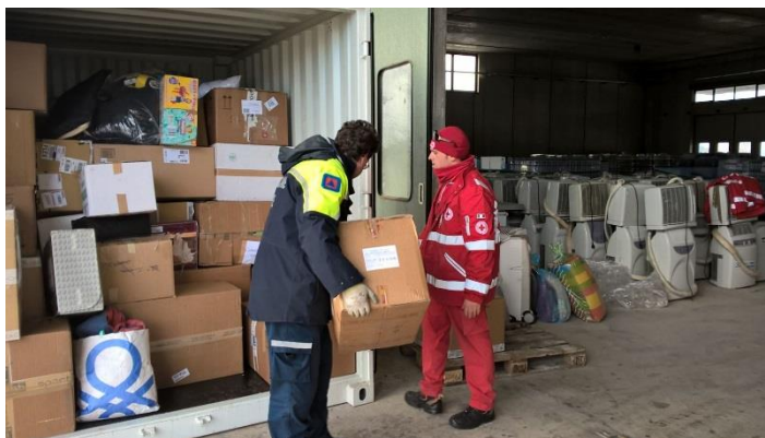
Food and non-food items, medicines, hygiene and other items of basic needs are delivered from the central warehouse of the Italian Red Cross.

The following villages remain isolated in Abruzzo region: Arsitia, Basciano, Campotosto, Capitignano, Castellalto, Farindola, Montebello, Montereale, Montorio al Vomano, Notaresco, Penne, Valle Castellana and Villa Celiera. The following villages cannot be contacted, nor physically, neither by phone: Pietracamela, Rocca Santa Maria, Castelli, Crognaleto and Bisenti. Currently, some 93,000 people are without light in the region of Abruzzo.