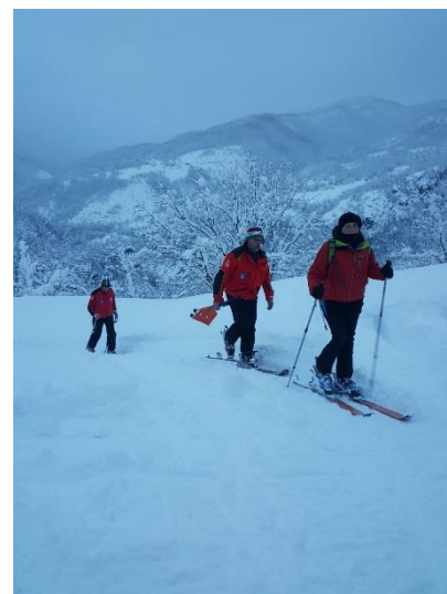
Many villages are only accessible on foot or skis due to the heavy snowfalls.

Roseto (Teramo): Two Italian Red Cross 4x4 vehicles are deployed to provide social welfare services. The town hall has been established as an Emergency Operations Centre. Some locations are still isolated due to snowstorms.