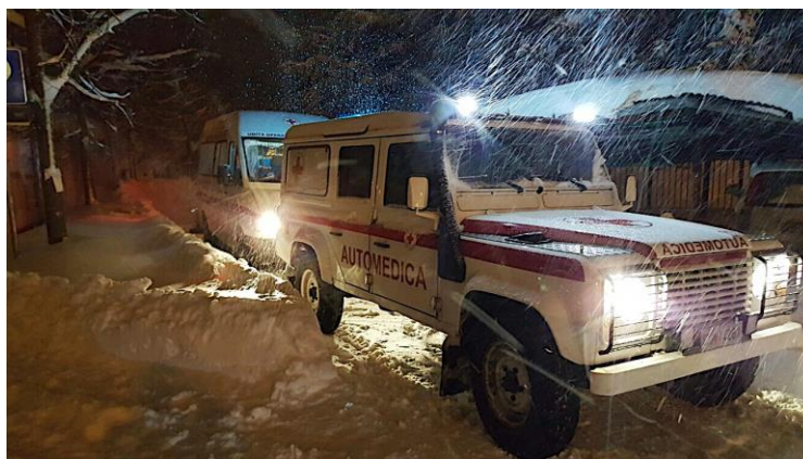
Four-wheel drive vehicles and special ambulances are used by the Italian Red Cross to reach isolated areas in need of medical assistance.

Due to the series of earthquakes, an avalanche hit the Hotel Rigopiano di Farindola situated in a ski resort in the town of Farindola, in central Abruzzo region. The force of the avalanche has partially brought down the hotel's roof and shifted the building ten metres off its foundations in addition to completely burying it under the snow. Up to now, ten people have been rescued, six people have been confirmed dead, including, tragically, one hotel staff member, who was an off-duty Italian Red Cross volunteer. Some 23 people are yet reported missing as a consequence of the avalanche.