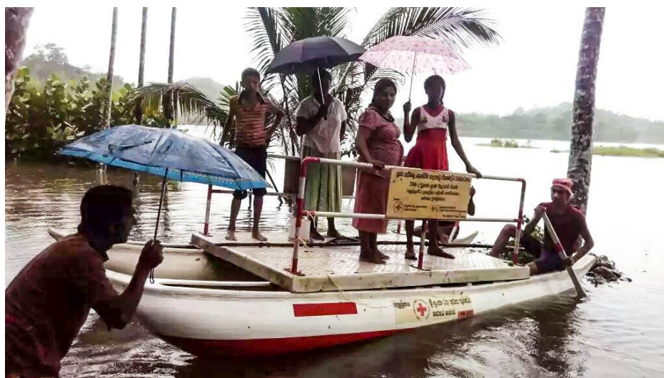
Ferry boats from previous SLRCS project used to evacuate people.

The Sri Lanka Red Cross Society (SLRCS) has been issuing weather warnings to the general public and put it branches on high alert from the outset. Social media platforms such as Twitter and Facebook as well as the SLRCS website have been used actively to convey messages to the public and report on response actions since 25 May 2017.