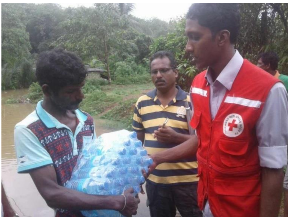
Sri Lanka Red Cross volunteer distributing drinking water to a local resident affected by the floods.

The IFRC country team is in constant communication with SLRCS and has made available initial funding from to kick start immediate support. An emergency plan of action is under preparation and an allocation from its Disaster Relief Emergency Fund is under consideration. Further technical support is provided from IFRC offices in New Delhi and Kuala Lumpur.